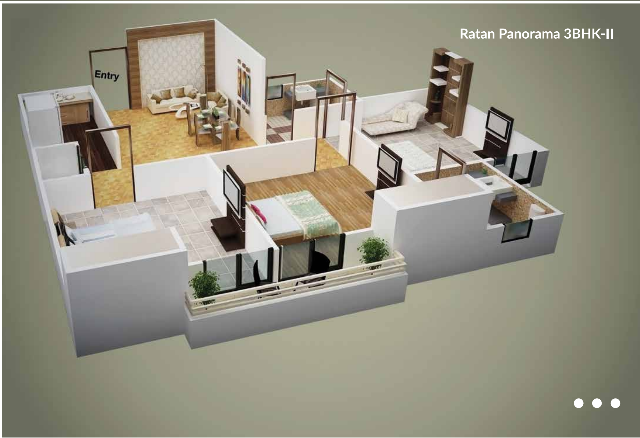
Ratan Panorama 3BHK-II